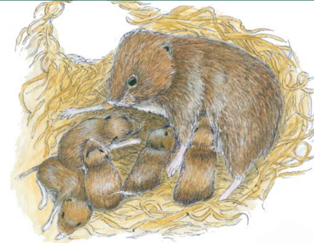
Field Mouse feeding its young